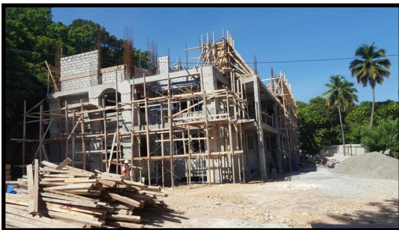
The new STEP campus building